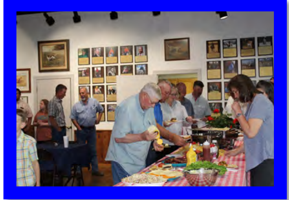
The serving line at the AFTCA Region 6 and Mid-South Association Awards Banquet May 18, 2024. They enjoyed on the spot hamburgers and hot dogs.