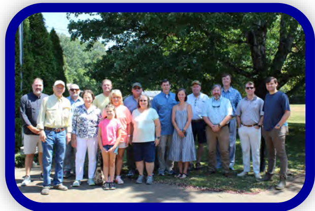
(ABOVE) Memphis Quail Forever Chapter came by for a tour August 24. We enjoyed having them visit us.