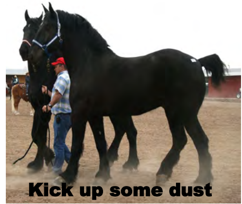
Kick up some dust

Hello everyone! It has been a minute since our last newsletter. We have been quite busy here at the museum with the annual Bird Dog Foundation Art Contest for area students in kindergarten through the 12th grade, the annual Bird Dog Foundation Senior Essay Contest, which awards scholarships to graduating seniors heading off to college, and also several events including the AFTCA Region 6 and Mid-South Association Meeting & Awards Banquet and the NBHA Annual Awards Banquet. For more information on any of these events, just check out the pictures in this newsletter.