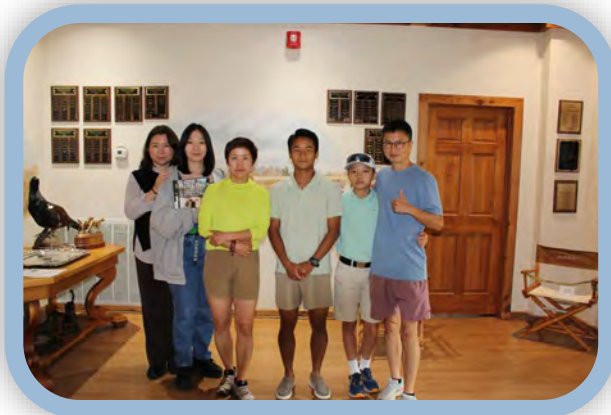
(ABOVE) We had these folks from China to visit us in May