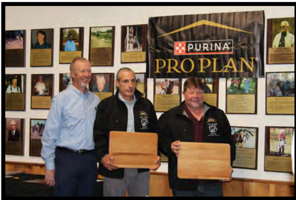
NBHA Annual Awards Banquet